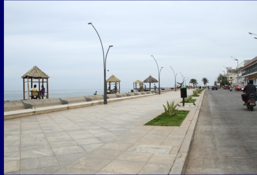
Beach Promenade, Puducherry