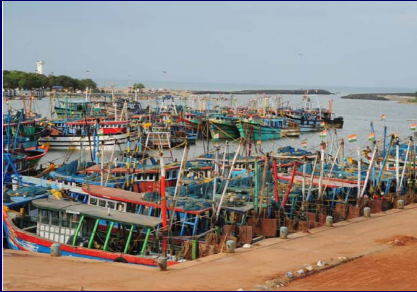
Karaikal Fishing Harbour