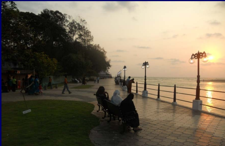
Riverside Walkway, Mahe